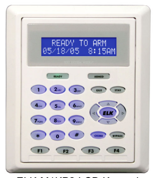
ELK-M1KP2 LCD Keypad